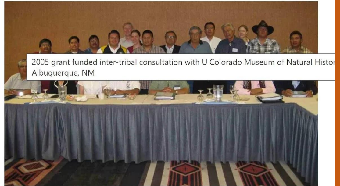
2005 grant funded inter-tribal consultation with University of Colorado Museum of Natural History, Albuquerque, NM

Consultation FOA #: The FY2023 Funding Opportunity Announcement (FOA) and accompanying Notice of Funding Opportunity (NOFO) can be