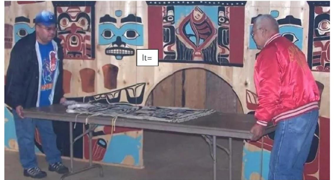
Repatriated tunic being placed in Klukwan Clan House.

Museums with NAGPRA collections, Indian Tribes (including Alaska Native tribes and villages), and Native Hawaiian organizations, all as defined under NAGPRA, are eligible to apply.