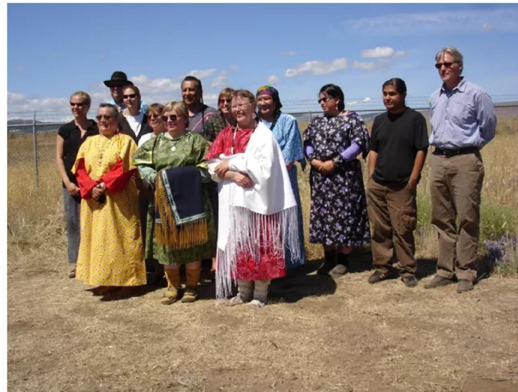
Joint inter-tribal repatriation of human remains and funerary objects, FY2007 Repatriation grant